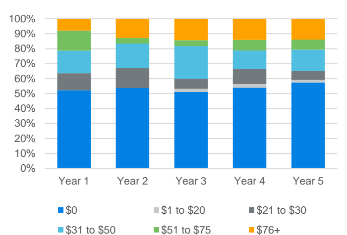
FIGURE 1: MONTHLY MEMBER PREMIUM IN YEARS 1 THROUGH 5 BASED ON ENROLLMENT

Figure 1 shows the percentage of members enrolled in plans of varying premium levels over the first five years of an MAO entering the market. As discussed, over half of plan enrollment was in $0 premium plans in year 1 and this trend continued each year of the five-year time period analyzed.