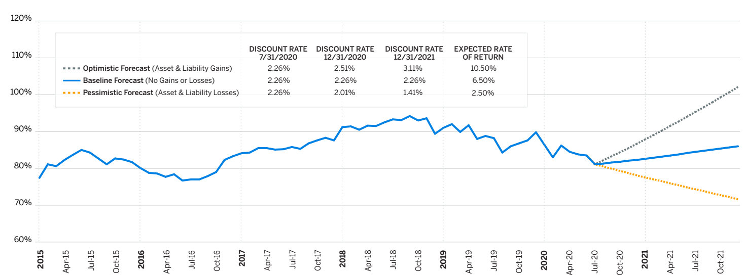
FIGURE 2: MILLIMAN 100 PENSION FUNDING INDEX — PENSION FUNDED RATIO

The projected benefit obligation (PBO) also rose during July, increasing the Milliman 100 PFI value to $2.047 trillion. This marks the first time the PBO of the Milliman 100 PFI has crossed the $2 trillion threshold. The increase in liabilities resulted from a decrease of 39 basis points in the monthly discount rate to 2.26% for July, from 2.65% in June. July's discount rate eclipses the previous discount rate low observed in June and once again sets a new record for lowest discount rate observed in the 20 year history of the Milliman 100 PFI.